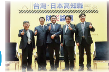
2016 Taiwan and Japan Resilience & Disaster Prevention Forum