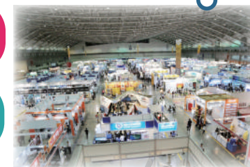
2017 Secutech Expo in Taipei International Fire&Safty