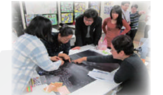
Hazard Mitigation Planning, Education, and Drill