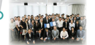
2017 Open Data Workshop between Taiwan and Japan on Disaster Prevention