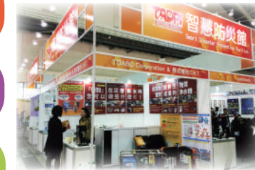
2016 Smart Disaster Prevention Technology Pavilion