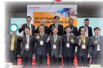
2017 Asia Pacific Smart Disaster Prevention Forum and Exhibition