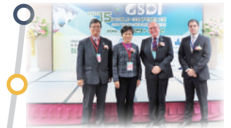
2016 Global Spatial Data Infrastructure Association (GSDI) Conference in Taiwan