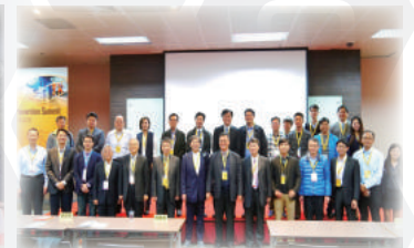
2017 General Membership Meeting